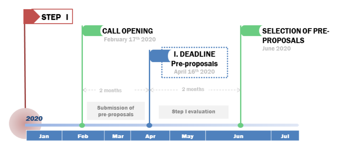
Figure 1: Step 1 process

The Consortium Coordinator must submit a pre-proposal on behalf of the consortium, providing key data on the proposed project. The deadline for the submission of the pre-proposal is 16.04.2020 , 17:00 CEST (Berlin time).